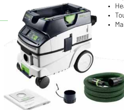
CTM26EI | 577921 Bluetooth Dust Extractor 26 litre $1,990 $2288.50 incl gst

with conical geometry for high suction power anti static function prevents static build up