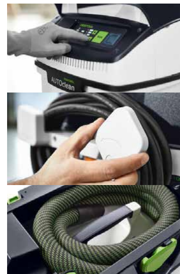
CTM36EI | 577925 Bluetooth Dust Extractor 36 litre $2,290 $2633.50 INCL GST