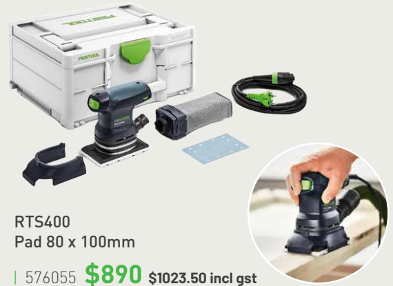
RTS400 Pad 80 x 100mm