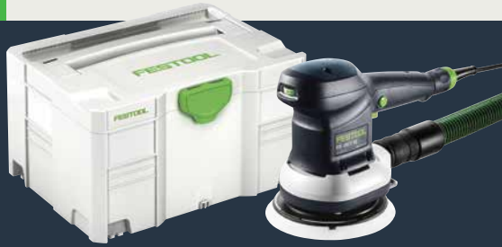
ETS 150/3 EQ-PLUS