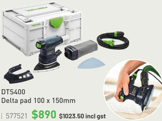
DTS400 Delta pad 100 x 150mm