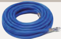
HOSE, BLUE FLEX (HALF)