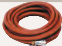
HOSE, RED RUBBER (HARR)

BLUE Flex and Red Rubber Hose Assemblies with Connector and Coupler fitted. Available in made-up lengths 10, 15, 20, 30 metres.